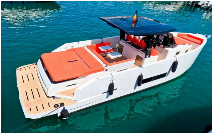
12.8 m 2024 De Antonio Yachts 42, Seastar €580,000 Tax: Not Paid Ibiza, Spain