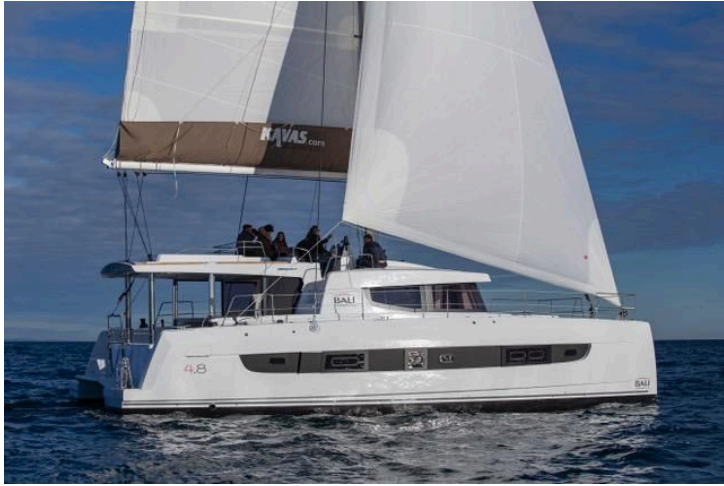
14.8 m 2020 Bali 4.8, Tatani €760,000 Tax: Not Paid Badalona, Spain