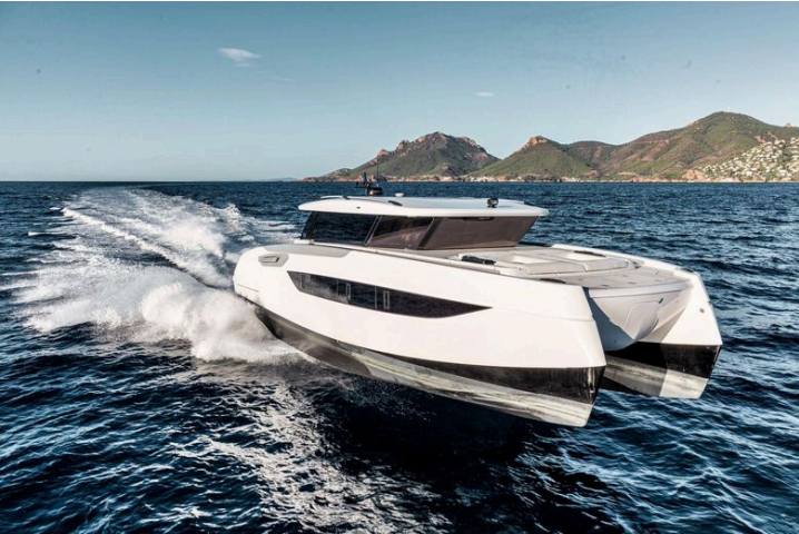
15.9 m 2025 Sunreef 55 Ultima, R2D2 €2,700,000 Tax: Not Paid Sitges, Spain